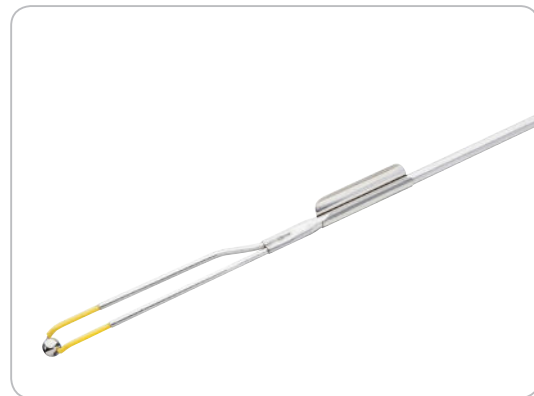
Figure 3. Roller Ball

An advantage of this technique is that it does not require any cutting at all and therefore women who have conditions that affect their blood or are on blood thinning medication may benefit. It may be necessary to time the procedure to just after a menstrual cycle or have medication that will keep the endometrium thin if this is the procedure chosen.