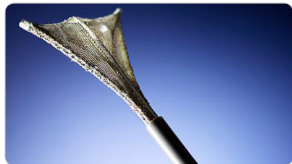
Figure 4. Electrosurgical resection endometrial ablation

Electrosurgical resection endometrial ablation: during this endometrial ablation a single-use sterile device is placed into the uterine cavity in a closed position and then opened out, a bit like a small and flattened umbrella (Figure 4). The surface of the device is wire mesh and this is attached to a generator that has a suction device in it. The lining of the uterus is sucked onto the wire mesh and an electric current is passed through the mesh. This destroys the entire endometrium.