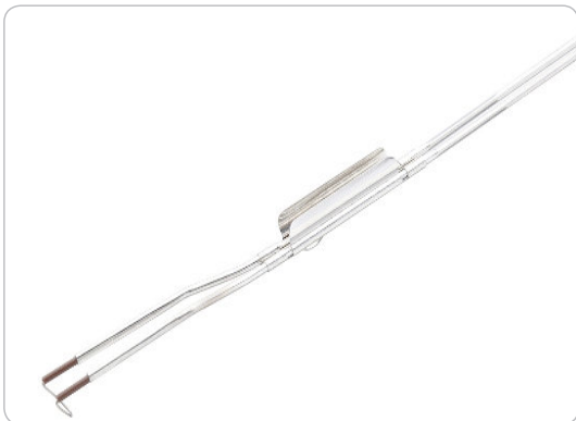
Figure 2. Wire Loop

An advantage of this technique is that it can be performed at any time of the month, without specific preparation, since the lining layer is removed and the underlying muscle layer is easily identified. A disadvantage is that it requires the tissue to be cut, which may cause bleeding from the blood vessels in the muscle layer.